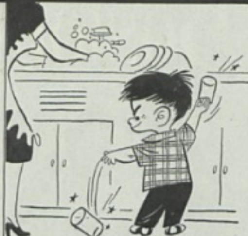
...lets one tumbler drop to floor (it bounces!)... bangs another on the sink (it doesn't even chip!)