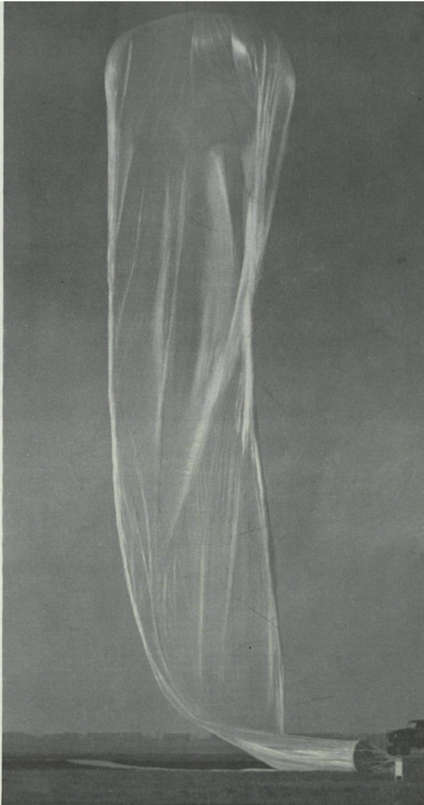
A flying disk at rest? Expansion in the stratosphere makes gleaming monsters of these translucent plastic balloons used by the Navy for cosmic-ray research. They have floated over all parts of the U. S.