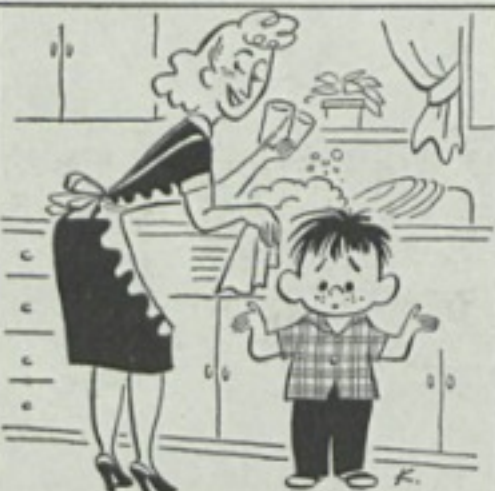
...hears his mother say, "Save your strength, Bobby. Those are Corning Double-Tough Tumblers. Here's a dry dish towel."