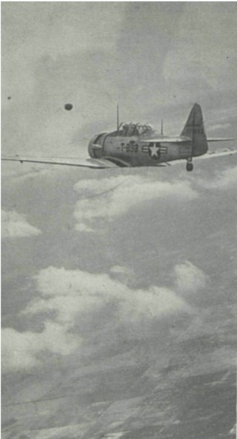
Weather balloons, like the one this plane is approaching, explain some "disks," but not all.